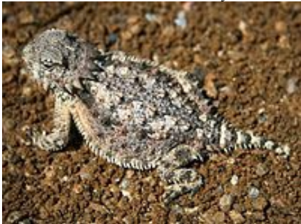
(g.) Mojave Fringe-toed Lizard Uma scoparia