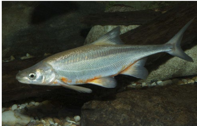
(d) Razorback Sucker